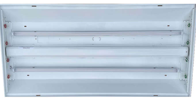
2x4 LMK retrofit completed with ballast cover replaced.