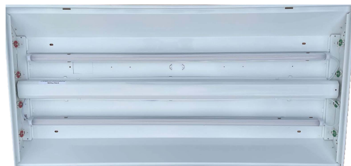
2x4 LMK retrofit completed with ballast cover replaced.

Manufactured by: Hangzhou LMenergysolution Lighting Company, Distributed by: LED Stick Company Florence, Alabama