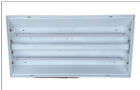
LMK-DIM Power Whip Wiring Follow 0-10VDC Controller Manufacturers Wiring Instructions If 0-10VDC dimming is not used, tape off Purple and Gray wires