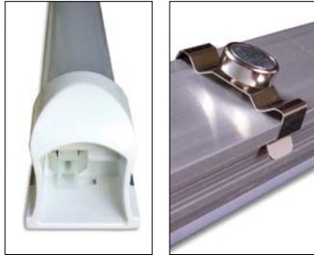
Magnet mounting is only allowed behind a lens Use tech screws to secure clips for exposed installations